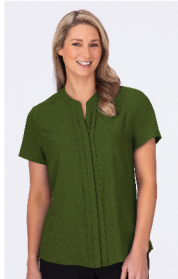
L-R MEGHAN 2211 ,ENVY 2288