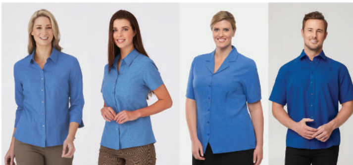
L-R EZYLIN® 2145, 2146, 2149, 4145