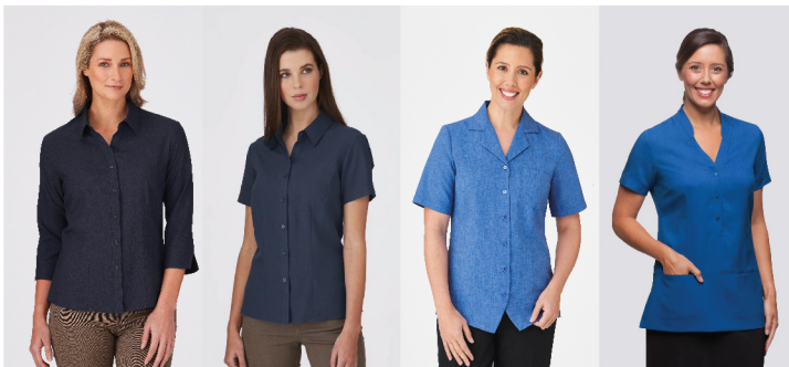
L-R EZYLIN® 2145, 2146, 2149, 2151