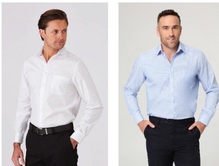
L-R TWILL SHIRT 4200, PINFEATHER 4265