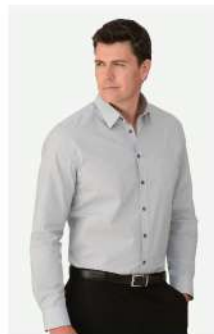
PINFEATHER 2265, 2267, 4265