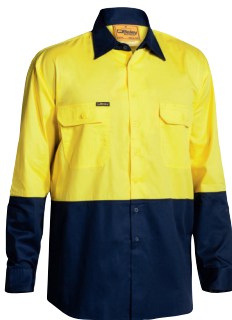
BS6895 2 TONE HI VIS COOL LW DRILL SHIRT LS