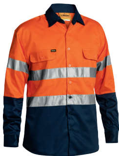
BT6456 3M TAPED 2 TONE HI VIS DRILL SHIRT LS