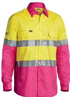
BS6696T 3M TAPED 2 TONE COOL HI VIS LW SHIRT LS