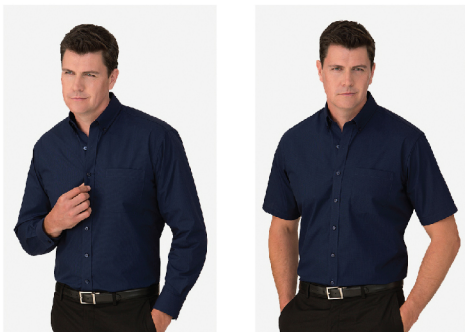
L-R MICRO CHECK 4102LS, 4102SS