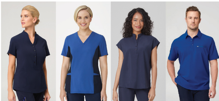
L-R ZIP BACK TUNIC 2284, CITY ACTIVE 2 TOP CA2T, CHRISSY 2283, CITY ACTIVE TOP CA4T