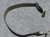
Adjustable Length Elastic Strap